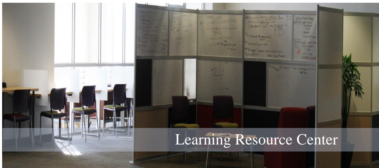
Learning Resource Center

Approval by the Course Committee will allow the project to proceed. Depending on the type of project, the students may have to complete required training (for example, laboratory biosafety training, blood-borne pathogen training, radiation safety training, IRB and HIPAA training for working with human subjects or accessing patient data, or IACUC training for working with laboratory animals). Projects that include human research subjects will require approval by the CNU IRB. Similarly, if laboratory animals are used, approval by the CNU IACUC will be required.